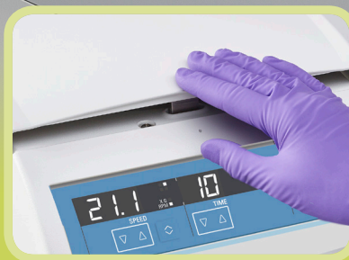
Fast one-click centrifuge lid closure